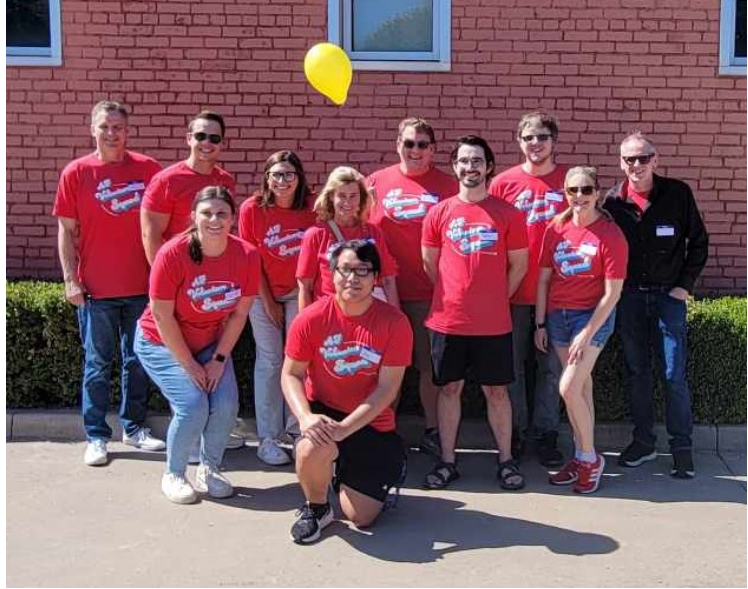
American Fidelity volunteers