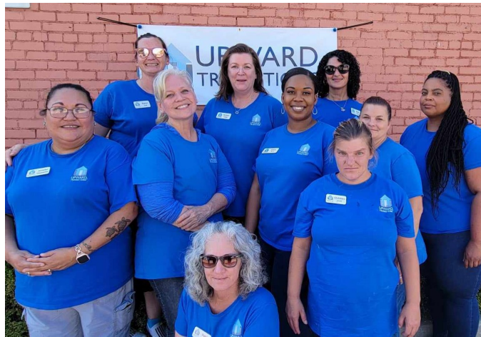
Upward Transitions staff

Lolli & Pops generously provided funnel cakes, chicken fries, and taquitos to the delight of our clients.