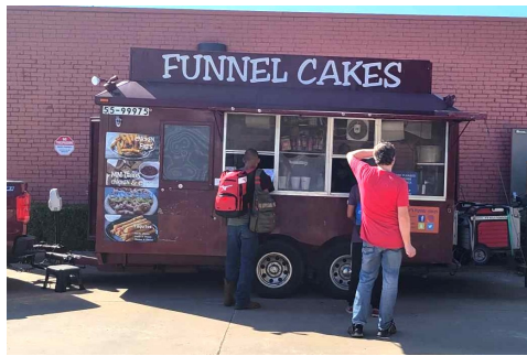
Lolli & Pops Funnel Cakes

Lolli & Pops generously provided funnel cakes, chicken fries, and taquitos to the delight of our clients.